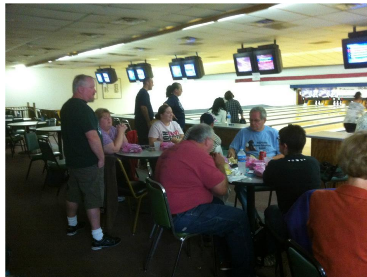
Guests enjoyed great food, prizes, and of course, helping Michiana's free-roaming cats!